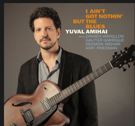
I AIN'T GOT NOTHIN' BUT THE BLUES